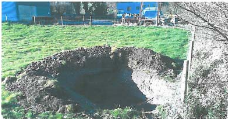
Hole dug in field (by others) opposite Farncomb Farm – note water in base

There was a hole dug in the field opposite Farncomb Farm, exposing the soil profile and the fact that waterlogging was present.