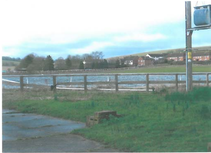
LAM013: Windsor House Paddock. 15 th FEB. 2014. Taken from Hungerford Hill end of Crowie Road, looking towards Baydon Road. Showing land above flood level on that side of Paddock.