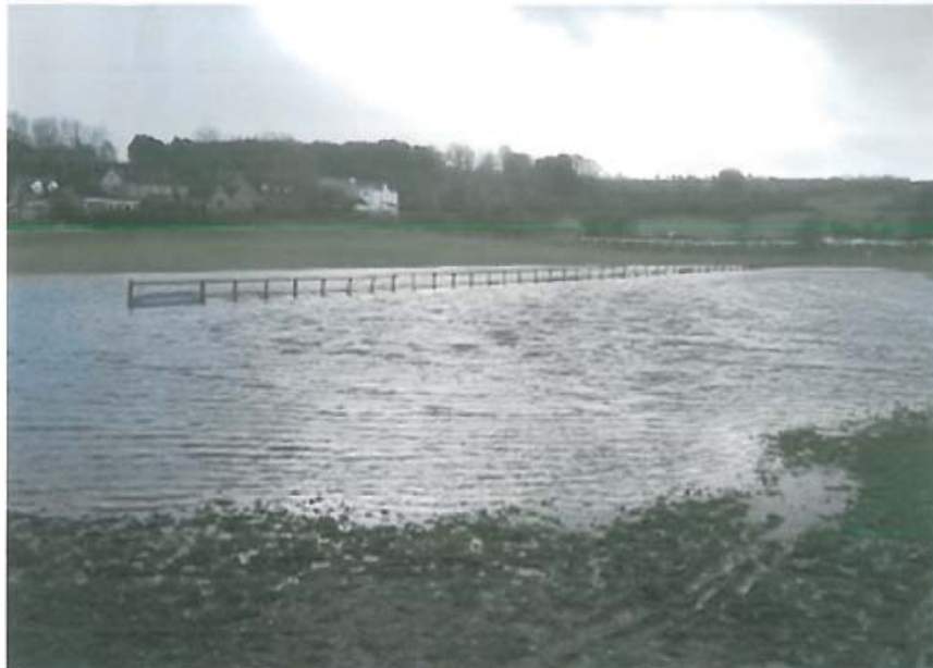
LAM013: Windsor House Paddock. 8 th FEB. 2014. Taken from gateway from Crowle Road, looking towards Hungerford Hill.