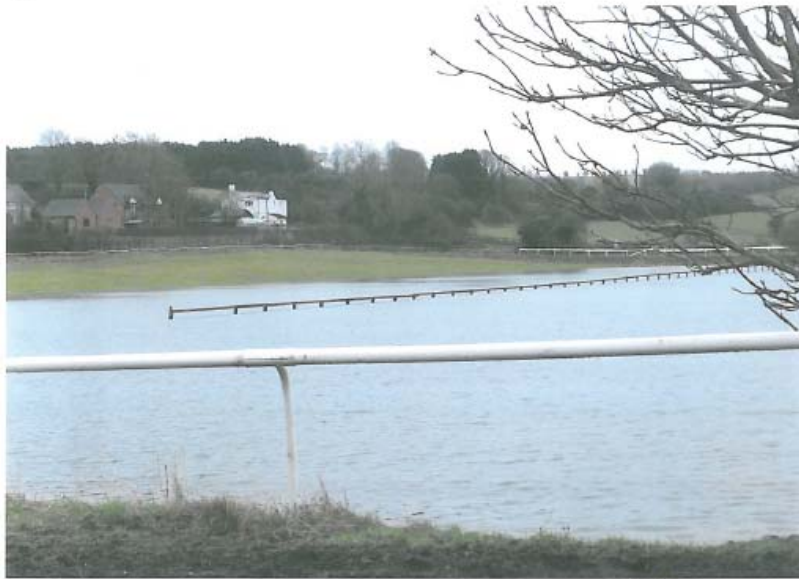
LAM013: Windsor House Paddock 14 th FEB. 2014. Taken from horse track / gallop at the gateway in the paddock from Crowle Road, looking towards Hungerford Hill. Shows land above flood level on that side of paddock.