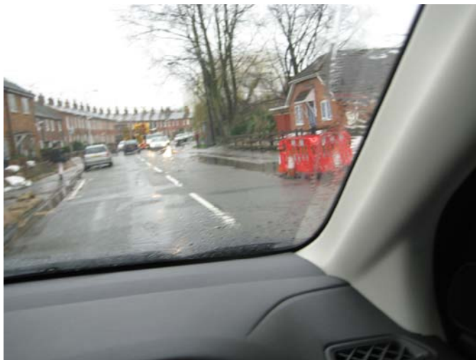
Figure 9: Flooding on Shaw Road near Mill House (River Burst Banks) 300mm