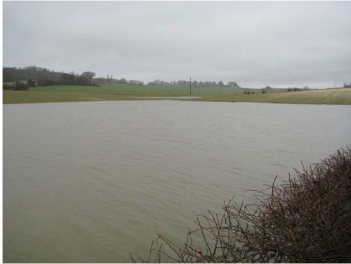
Figure 3: High Field Farm Flooding surface water 200mm deep