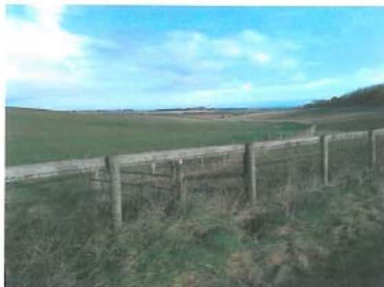
Looking east along Farncomb Down from just below the M4

The plan at Appendix 1 shows the approximate area of the catchment in red and the valley features in blue.