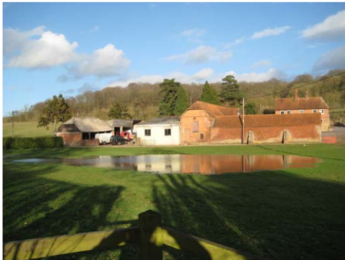
Figure 4: Surface water flooding at Whitfield Farm (200mm)