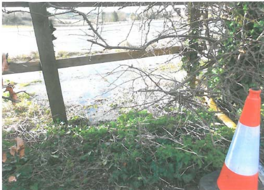
LAM013: Windsor House Paddock.

View along horse/track gallop, looking towards Hungerford Hill. Crowle Road is to the right, behind the hedge. Water across track. X marks pump.