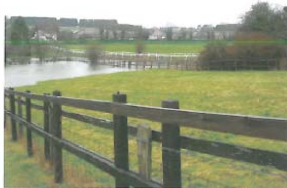
showing raised gallops

The catchment extends all the way up to and beyond the M4 motorway by Baydon, with the two main valleys being those extending up to Bailey Hill Farm and through Farncomb Down by the gallops cut into the down. The upper end of Farncomb Down is cut off by the Motorway embankment, where there appears to be no balancing pond or drainage system to catch water running off the motorway.