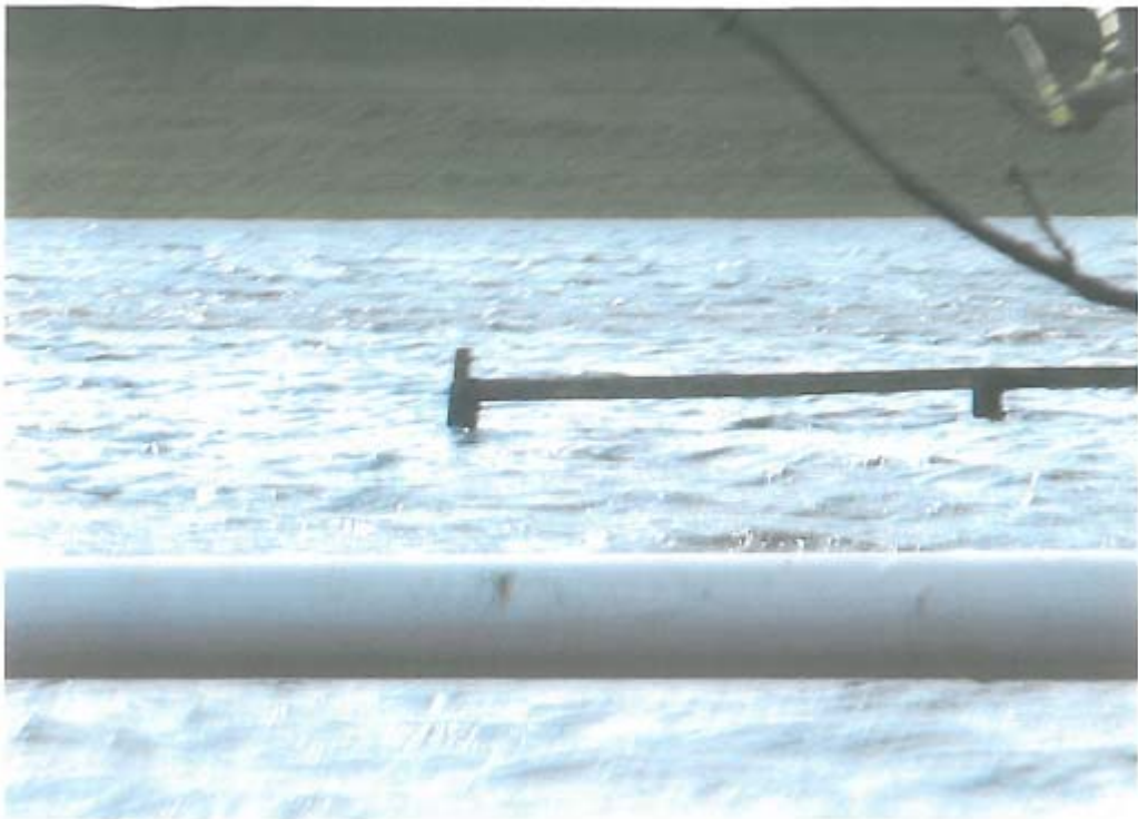
LAM013: Windsor House Paddock. 15 th FEB. 2014.