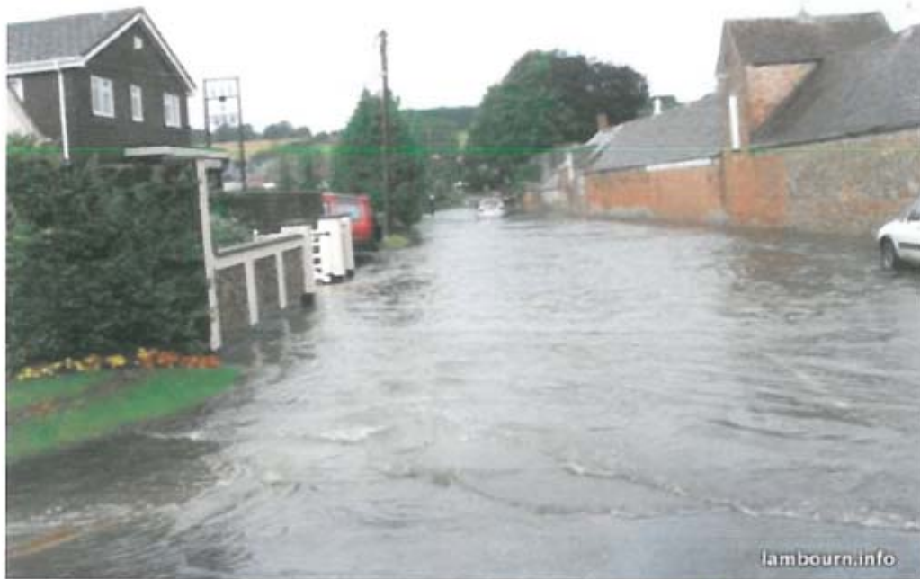
Flooding in Crowle Road, Lambourn. July 2007 (Windsor House Paddock is on the left. Water flowed down through the Paddock and across Crowle Road, down the High Street and through the buildings on the right of the photograph, flooding properties in the High Street and the Old Coachworks)