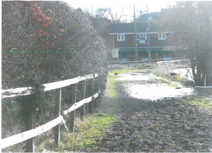
LAM013: Windsor House Paddock.