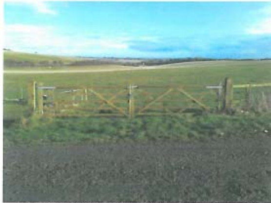
Looking east from the track beside the pumping station

Almost all of the catchment is down to grass, with only one field showing signs of recent arable use and now being grazed by sheep.