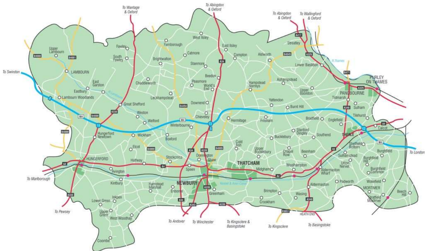
Figure 1.1 West Berkshire

1.10 Employment provision is diverse. West Berkshire has a strong industrial base, characterised by new technology industries with a strong service sector and several manufacturing and distribution firms. The areas that have the highest concentrations of employment are Newbury Town Centre and the industrial areas and business parks in the east of Newbury, the business parks at Theale, Colthrop industrial area east of Thatcham and the Atomic Weapons Establishments at Aldermaston and Burghfield.