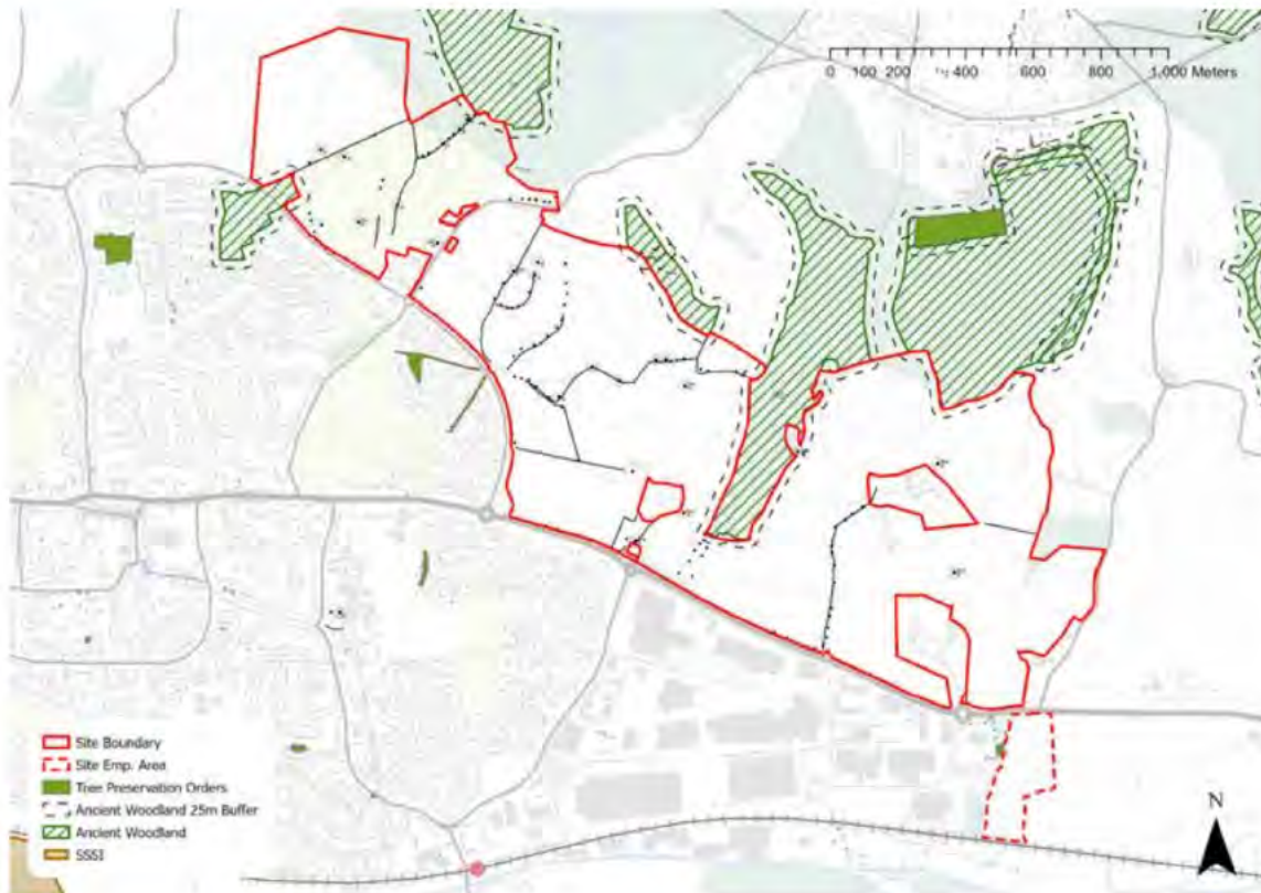
Fig 3: Green Infrastructure Plan as outlined in Stage 3 Thatcham Future (September 2020) study

Given the Sites close proximity to the proposed residential development on Policy SP17 site allocation, it is considered that firstly the Site should be included within the site allocation boundary of Policy SP17, as other similar sites have been and secondly it should be masterplanned to provide biodiversity net gain and/or strategic alternative natural greenspace ('SANG') for the wider allocation.