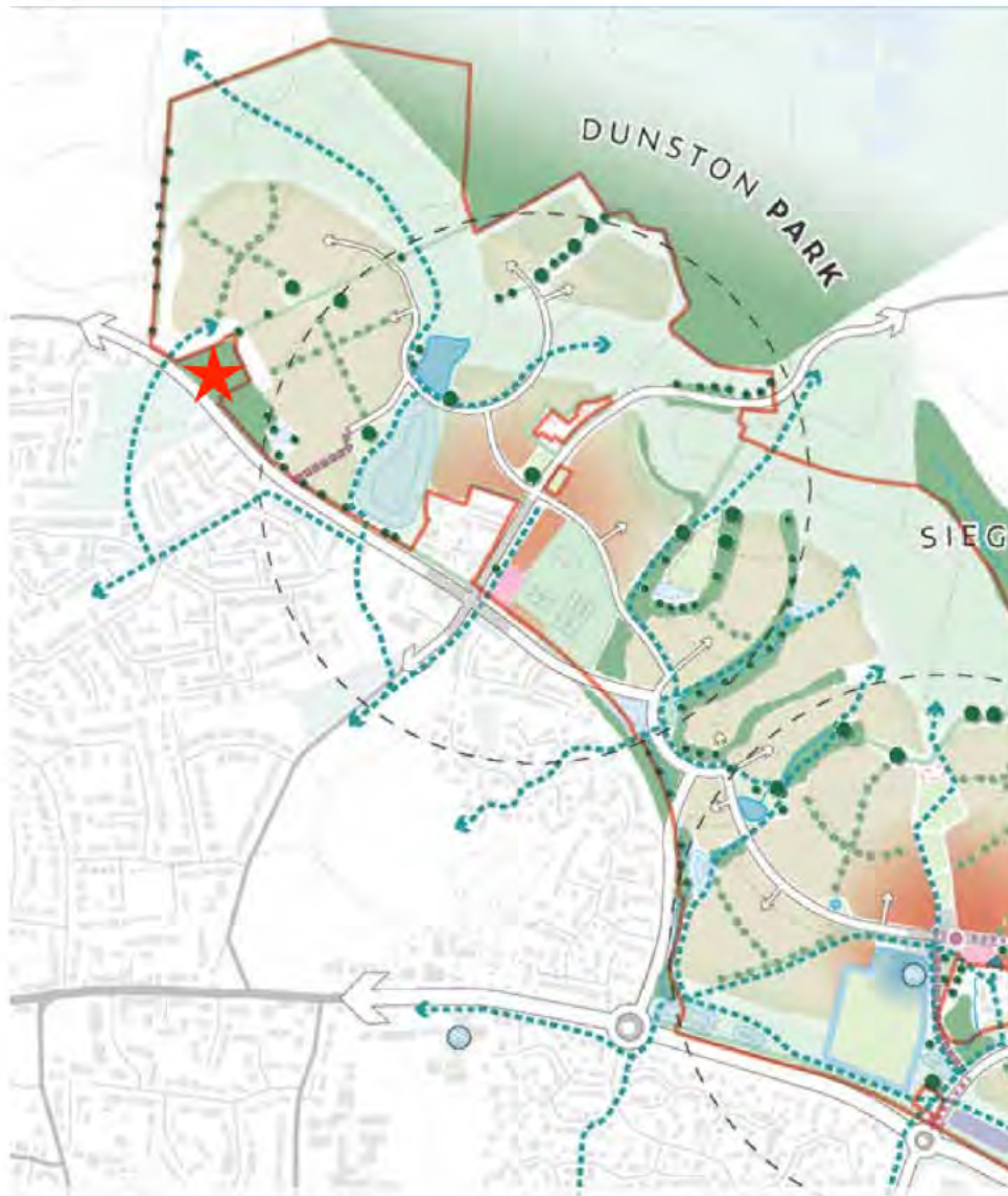
Fig 2: Site location (starred, ET Planning added) showing residential use to the north and east of the site, extract from Thatcham Strategic Growth Study Future (September 2020)

residential, as shown in Fig 2. It is important to note that the land parcel to the south of our client's site (and which is included within the site allocation boundary) also has a number of trees which have been able to grow for around 5 years and therefore are in a comparable position to our clients site.