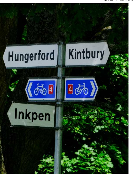
CIL Funded Projects (Left to Right): Road Signage, EV Charge Points, Cycle Path Improvements